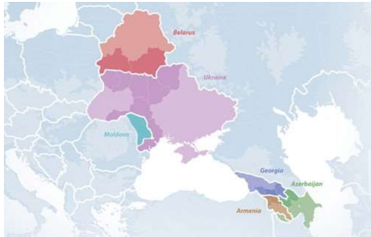
Figure 1: Eastern Partnership Territorial Cooperation Programme

The aim of the report is to summarise experiences and best practices with regard to people-to-people projects in Interreg and explore the possibility of transferring these projects to the above-mentioned EaPTC programmes.